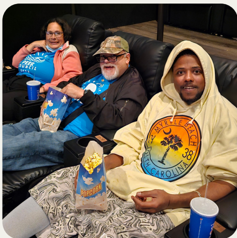
Pictured: Members of Peer Council at the movie theater